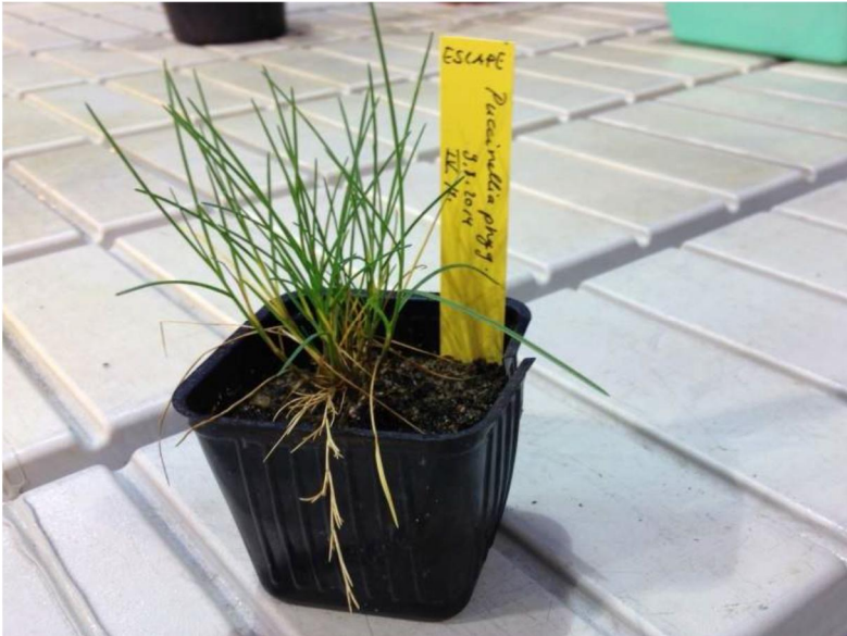
Figure 2. Puccinellia phryganodes in ex situ - cultivation in Oulu Botanic Garden 2014.